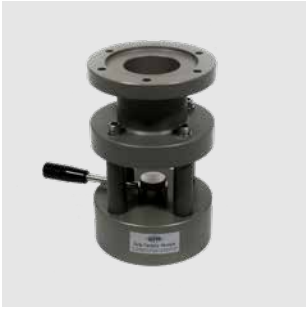
GF-9315 GF-9 adapter to Euro-adapter