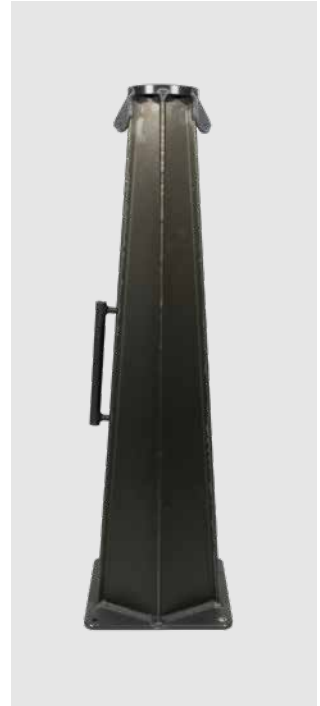
GF-9130 Mounting column for GF-9 (without pan bearing)