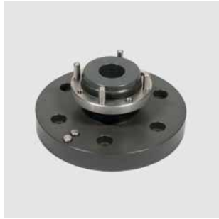
GF-9316 GF-9 adapter plate to Mitchell