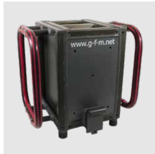
GF-9125 Counterweight bucket