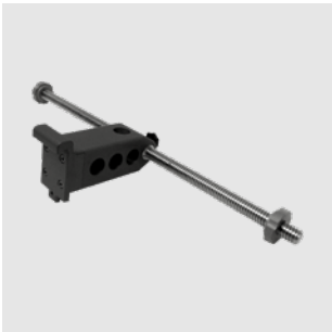
GF-9317 Counterweight rod adapter incl. weight rod