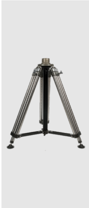
GF-9200 Tripod for GF-9 Crane (adjustable height and levelling system)